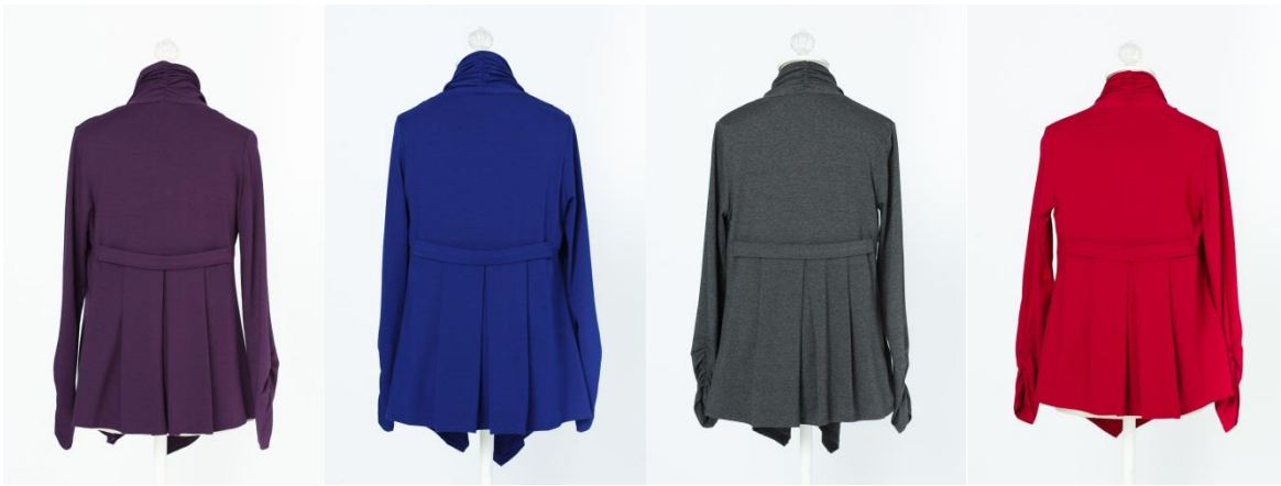
Rich Plum Sapphire Blue Heather Grey Red Wine