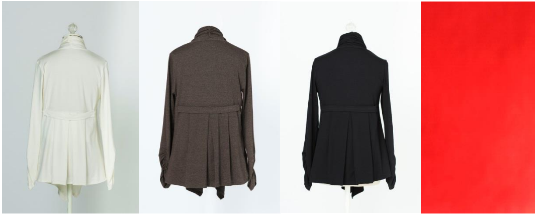
Au Naturel Heather Chocolate Black Noir July 2014 Persimmon